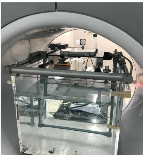
myQA HALO system setup at MedStar Southern Maryland Hospital Center for commissioning of the Halcyon system.

IBA has designed myQA HALO , a dedicated solution that allows medical physicists to efficiently and accurately perform all the required scanning for commissioning, acceptance and annual testing of the Halcyon system. The team at MedStar Health has now successfully commissioned their new Halcyon Machine version 2.0 using the myQA HALO solution. The entire commissioning work including system setup and all measurements was completed efficiently in one day as confirmation of the Gold Standard data used in the RTPS.